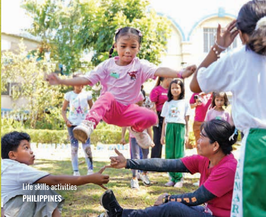
Life skills activities PHILIPPINES