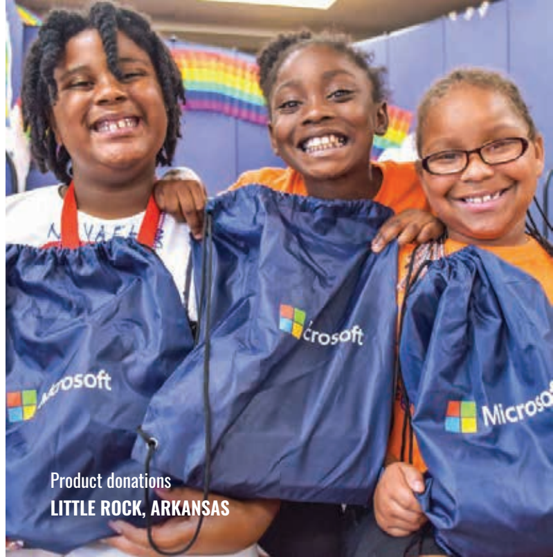
Product donations LITTLE ROCK, ARKANSAS