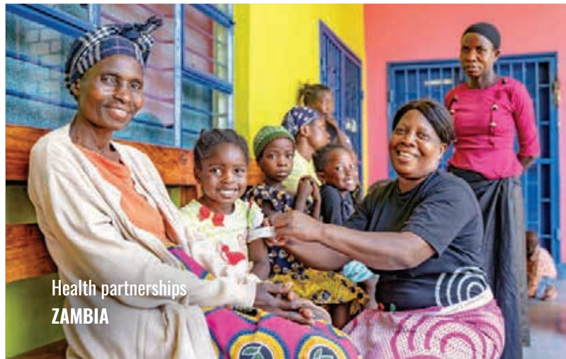
Health partnerships ZAMBIA