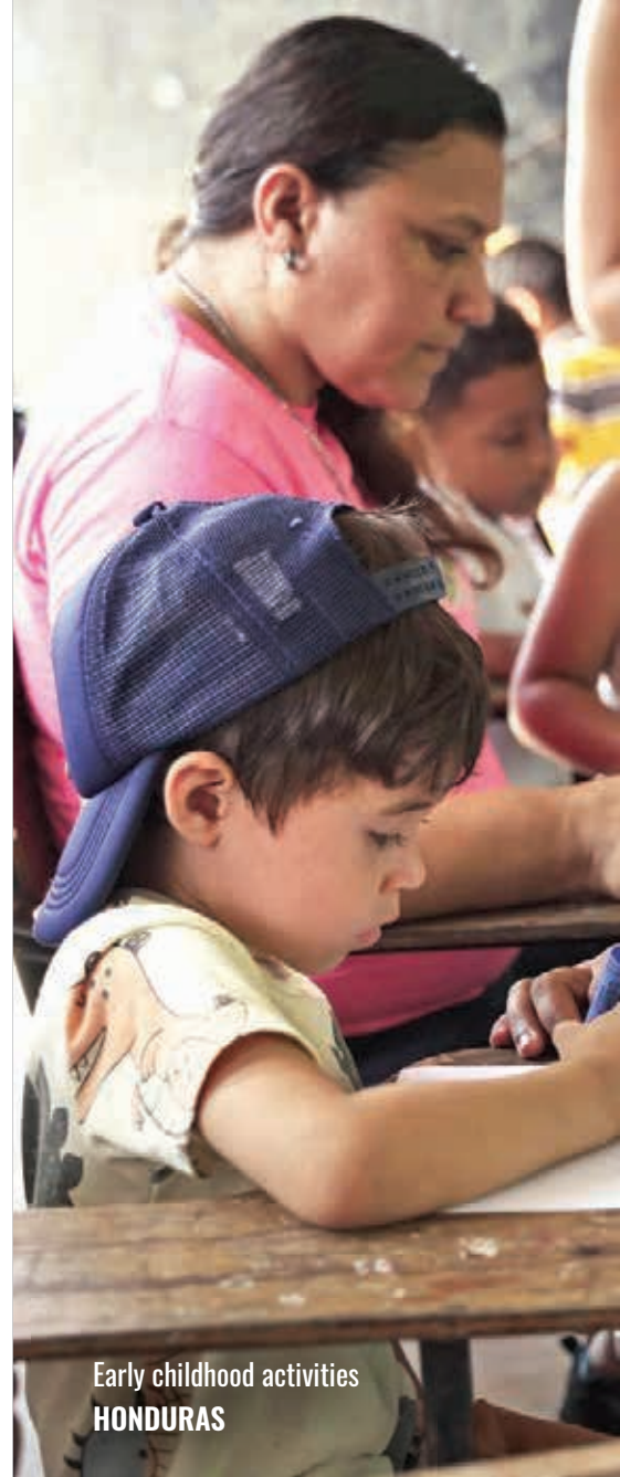
Early childhood activities HONDURAS