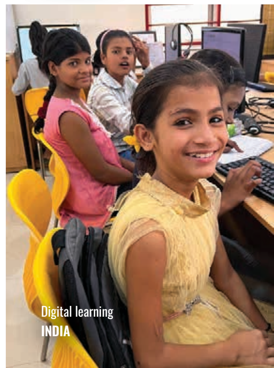
Digital learning INDIA